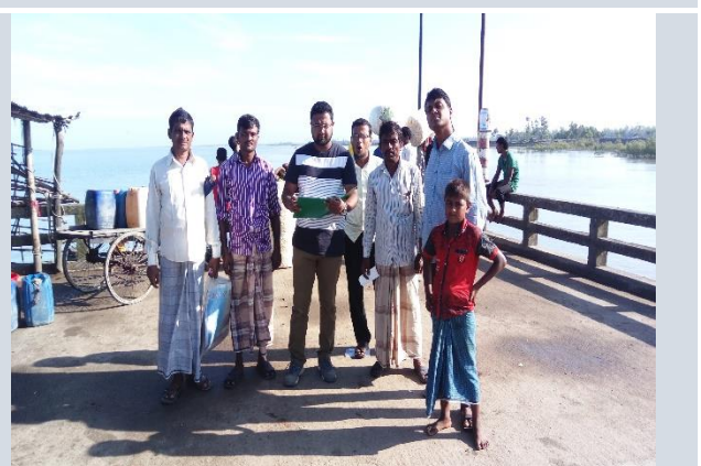
Figure No. 02: Matarbari USCCF Power Plant