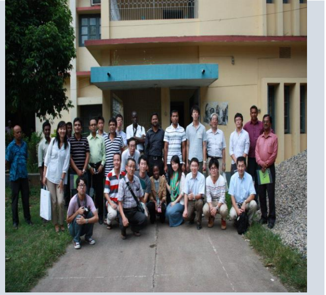
Figure: 01: NUGELP Japan Team, and ADB Team Field Visit